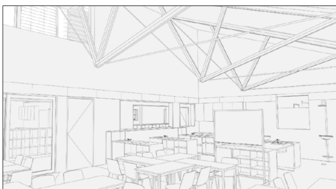
Figure 1. Internal view of wet science lab and general learning space