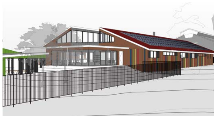
Figure 2. View of new STEAM facility from Roy Watts Road entrance