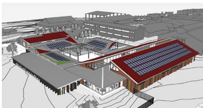
Figure 1. Aerial view of new STEAM facility