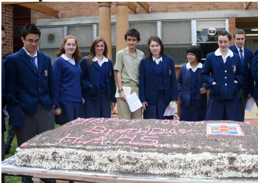
Some of our 2007 prefects look on at the 100th year birthday cake at the school centenary assembly.

Remember if you are interested in helping to fund some of the heritage group's initiatives please contact the Student Heritage Group c/HAHS.